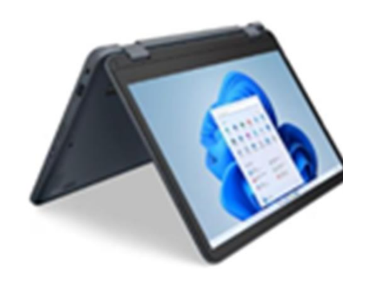
Lenovo 300w Yoga Gen 4