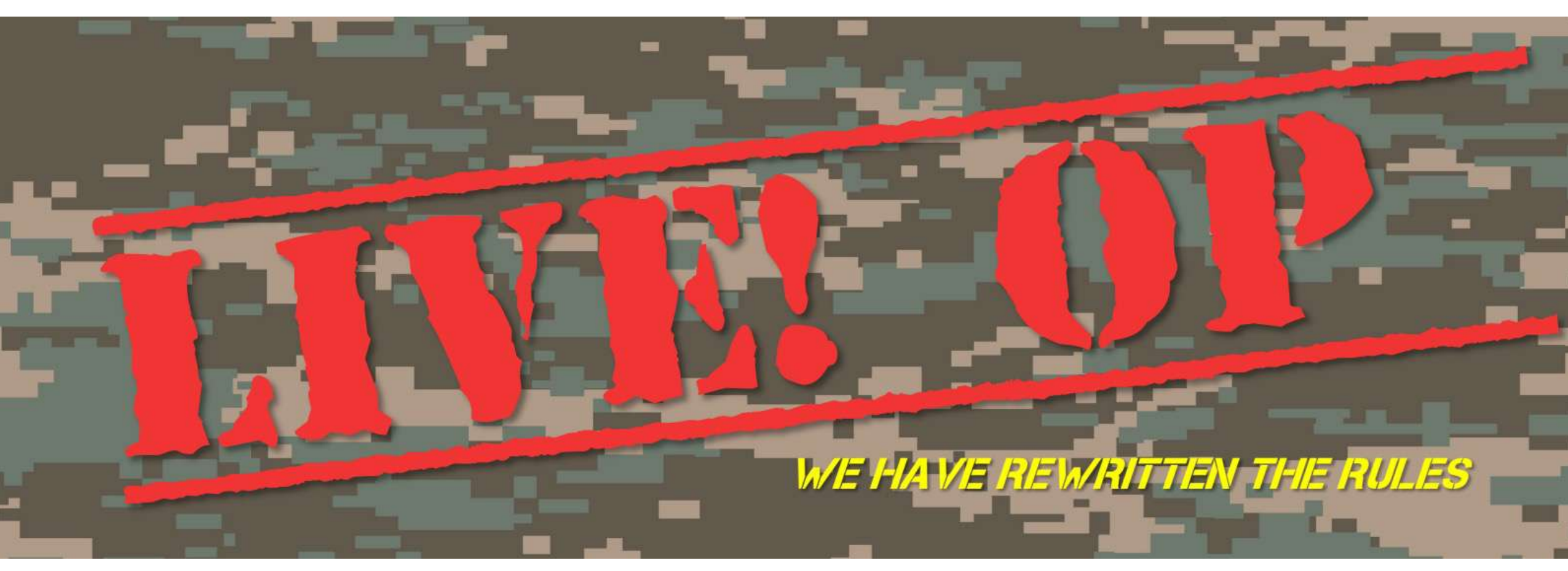
3<sup>rd</sup> - 5<sup>th</sup> January 2024